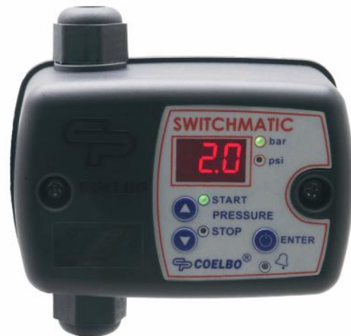
SWITCHMATIC 1 SWITCHMATIC 2 SWITCHMATIC 2A